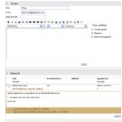
The built-in WYSIWYG editor allows operators to work with text content, format text, insert images, and create tables and links to other Web pages or documents.

Many of the functions, flows and even the appearance of the interface can be customized according to the customer's requirements. Templates can be further developed, changed and translated into other languages.