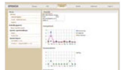
The built-in statistics function and report generator help you follow up the efficiency of your case management.