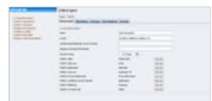
Inboxes, message templates, Web forms, reply times, escalation and access rights are managed in the administrator interface.