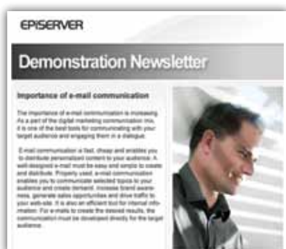
EPiServer Mail demonstration newsletter

E-mail communication is a key part of the digital marketing mix. Create customized messages and reach your target audience quickly and efficiently with EPiServer Mail. Forget the need for hardware, software and system operation. Forget the need for programming knowledge and focus instead on what you want to communicate to your target group, for both internal and external communication.